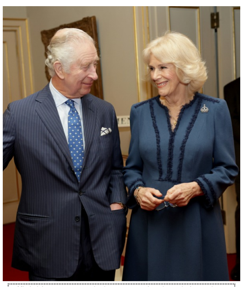
Official image to mark the Coronation